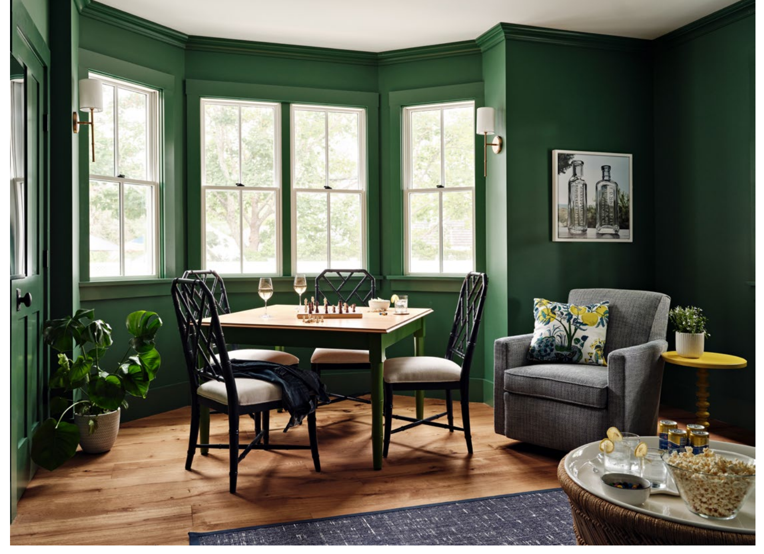
Interior designer Jennifer Perini chose a dark and soothing green for the walls of a small sitting room to offset the brightness of the home's beach town location.

"I thought to make that smaller space a bit moodier, with a deep-green wall color, because after a day out in the bright sunshine, it'd be nice to have a darker room to relax in in the evening." The cozy room still feels summery, with lemon-print pillows and dashes of bright color, but it provides a quieter space to retreat to, away from the hubbub of a bustling vacation home.