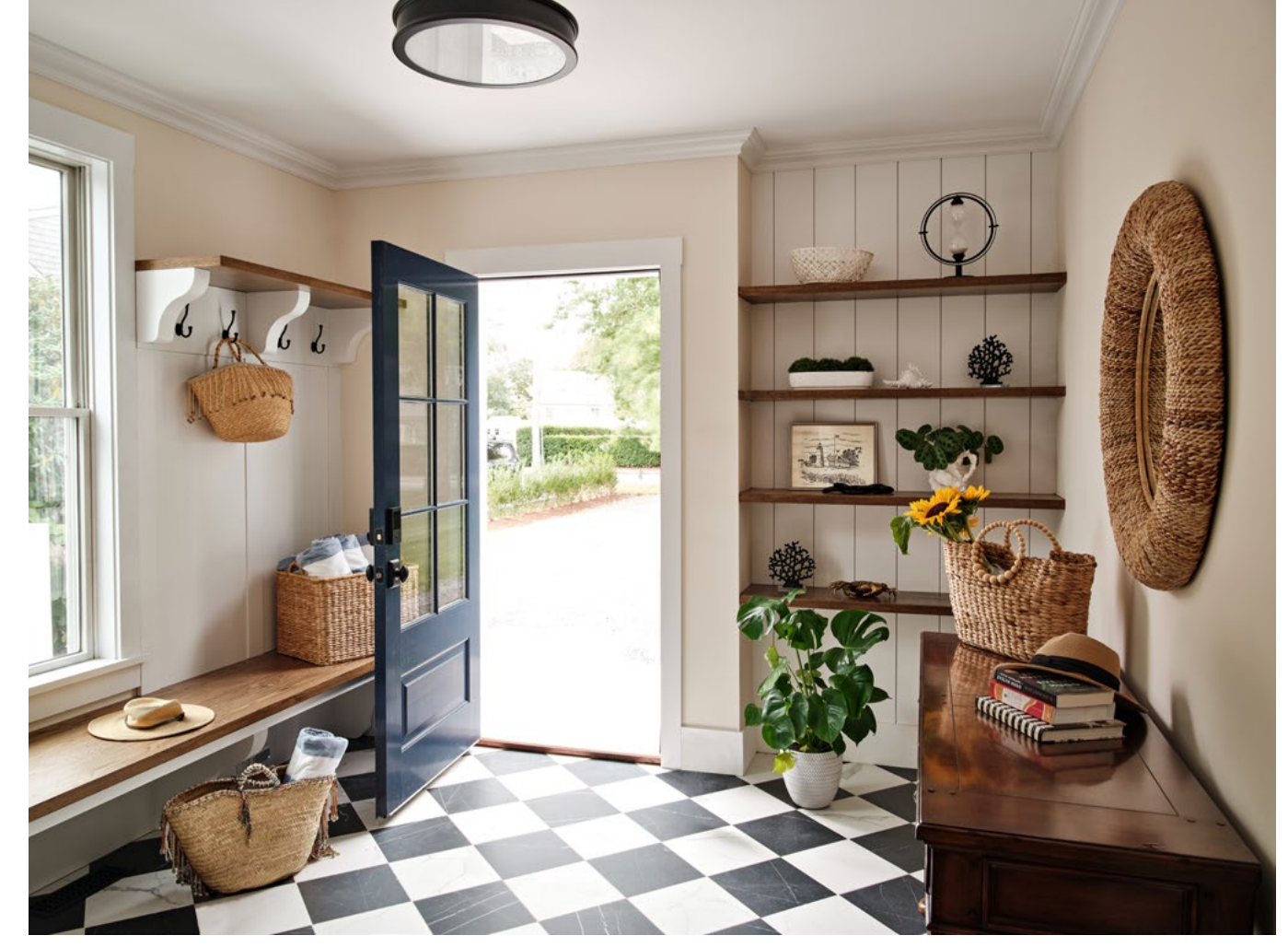
The home was redesigned to accommodate the busy summer comings and goings of a large family.